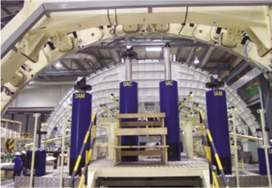
AIRBUS A380 Positioners from the AIT upper shell tool for the A380.