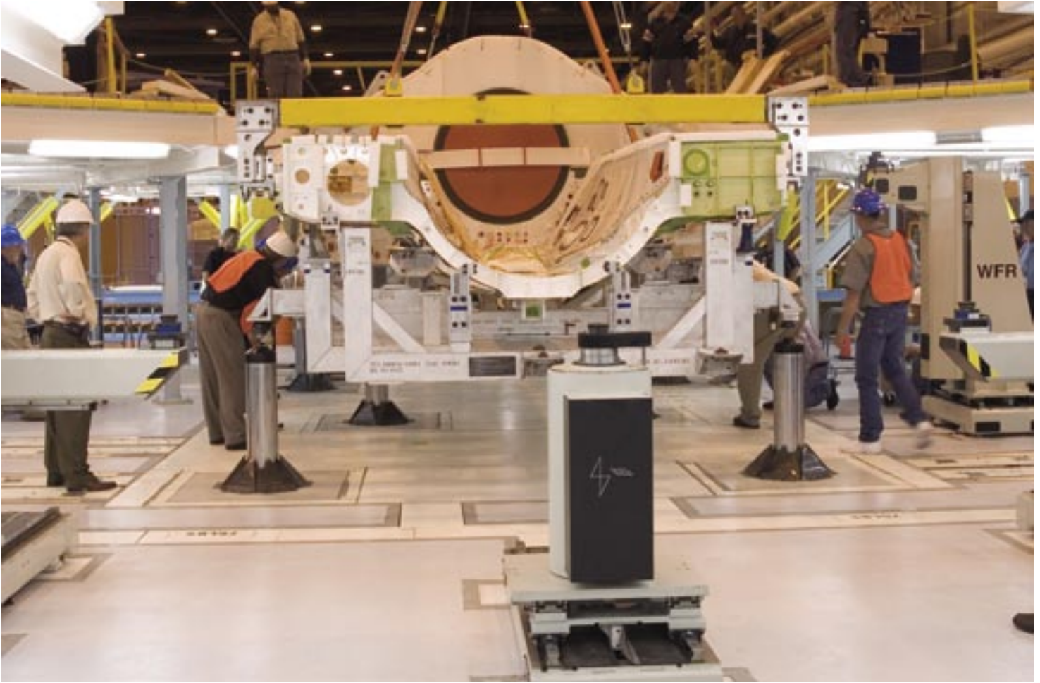
F-35 LASERS AIT has integrated many different types and makes of lasers, such as those used with the F-35 JSF.