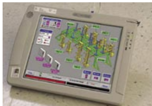
GUI TOUCHSCREEN Portable actuating devices, such as mobile pendants, have resulted in precision subassembly manipulation anywhere in the assembly process.

AIT's automated positioning systems incorporate laser measurement technology to facilitate aircraft structure alignment and join. The real-time laser measurement replaces jigs for locating parts and identifies out-of tolerance conditions before errors occur. Real-time part-to-part indexing offers higher tolerance, more flexibility, superior access, and improved ergonomics over traditional hard tooling. This improved method of assembly is controlled through the use of the GUI or joystick, making the system exceeding user friendly.