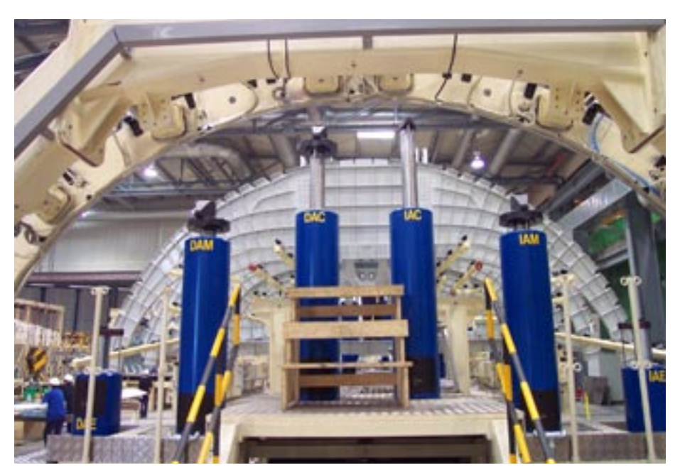
AIRBUS A380 ≈ Positioners from the AIT upper shell tool for the A380.