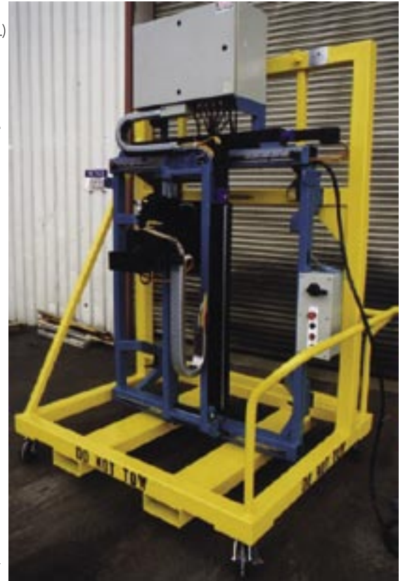
FIGURE 4 ✂ Global Aeronautica 787 flexible tracks at Charleston, SC, facility.