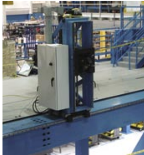
FIGURE 7 » Global Aeronautica 787 Side of Body Driller at the Charleston, SC, facility.