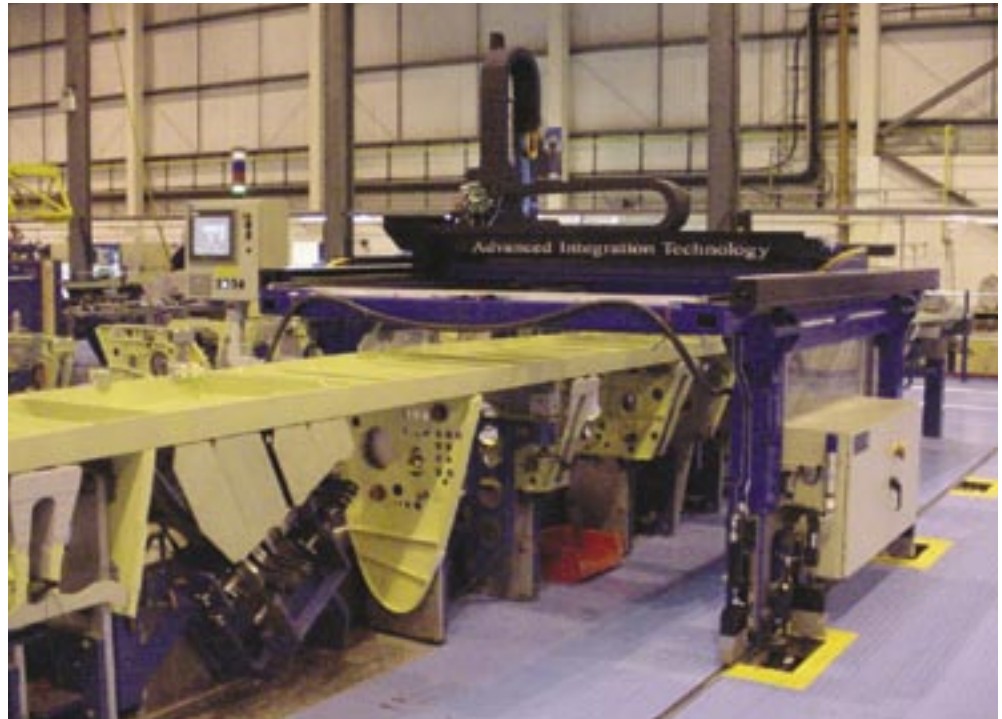
FIGURE 6 » Airbus A340 leading edge NCDJ drilling machine.