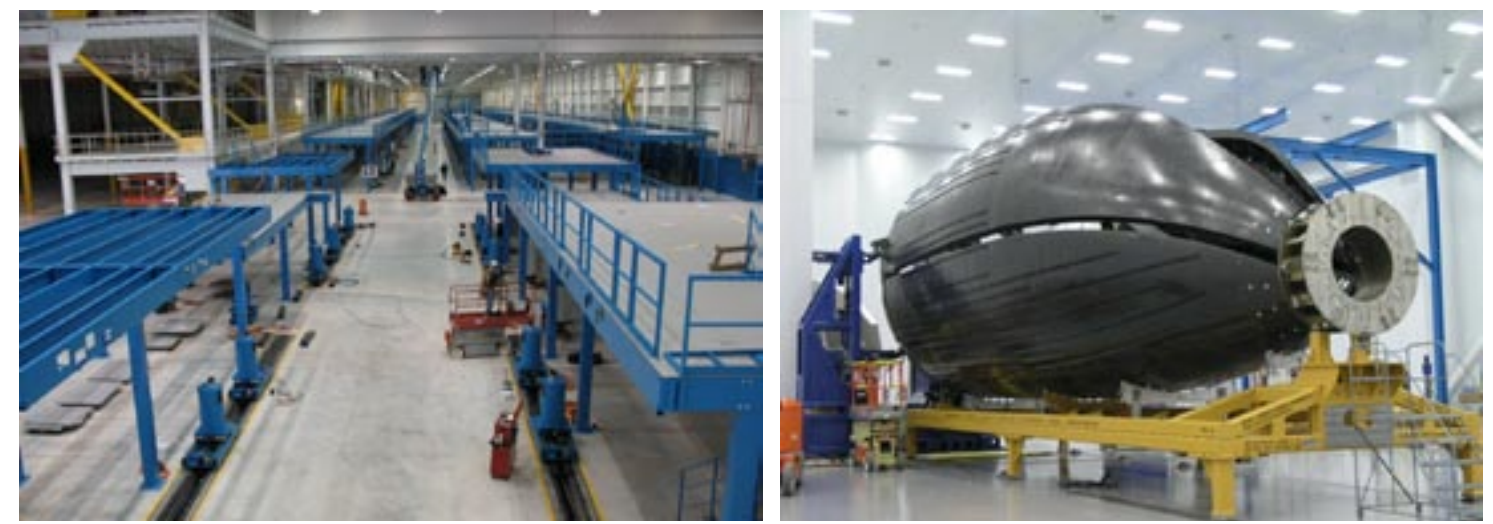
NEW SPACE/NEW WAYS AIT worked with Global Aeronautica to redefine the mandrel assembly process in its new 334,000-square-foot facility.