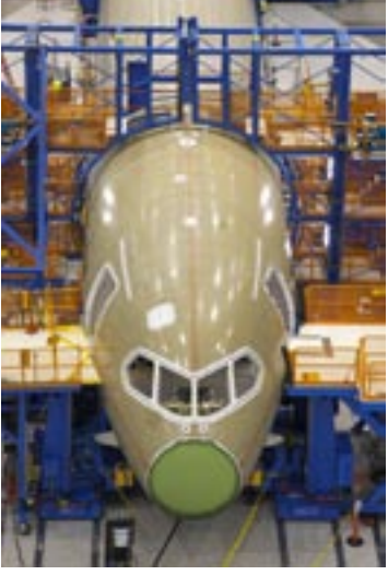
TIME SAVINGS A With AIT's automation advancements, the wings were joined in hours – not days.

AIT also provided total project integration for the three assembly systems - Horizontal Stabilizer, Vertical Fin, and Auxiliary Power Unit (APU) Installation Tool - using two subassembly platforms to facilitate the assembly join of aft fuselage. This new equipment revolutionized aircraft assembly and replaced the antiquated crane